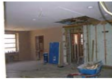
Office/lounge then & now

We have made tremendous progress. To date, the entire building has a new roof; all new electrical wiring and service have been install; new HVAC system is installed; the school and office areas have been totally gutted, reconfigured, sheet rocked and primer coat of paint has been applied. New light fixtures have been installed throughout the interior and exterior of the building. Termite damage has been removed, all necessary woodwork replaced and the entire facility has been treated against further infestations.