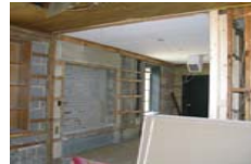
Studio "1" then & now