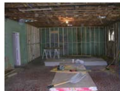
Dance Studio then & now