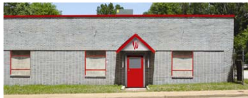
635 Elwood with some final touches

Rendering shows building with proposed paint & finishes.