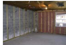
Studio "2" then & now